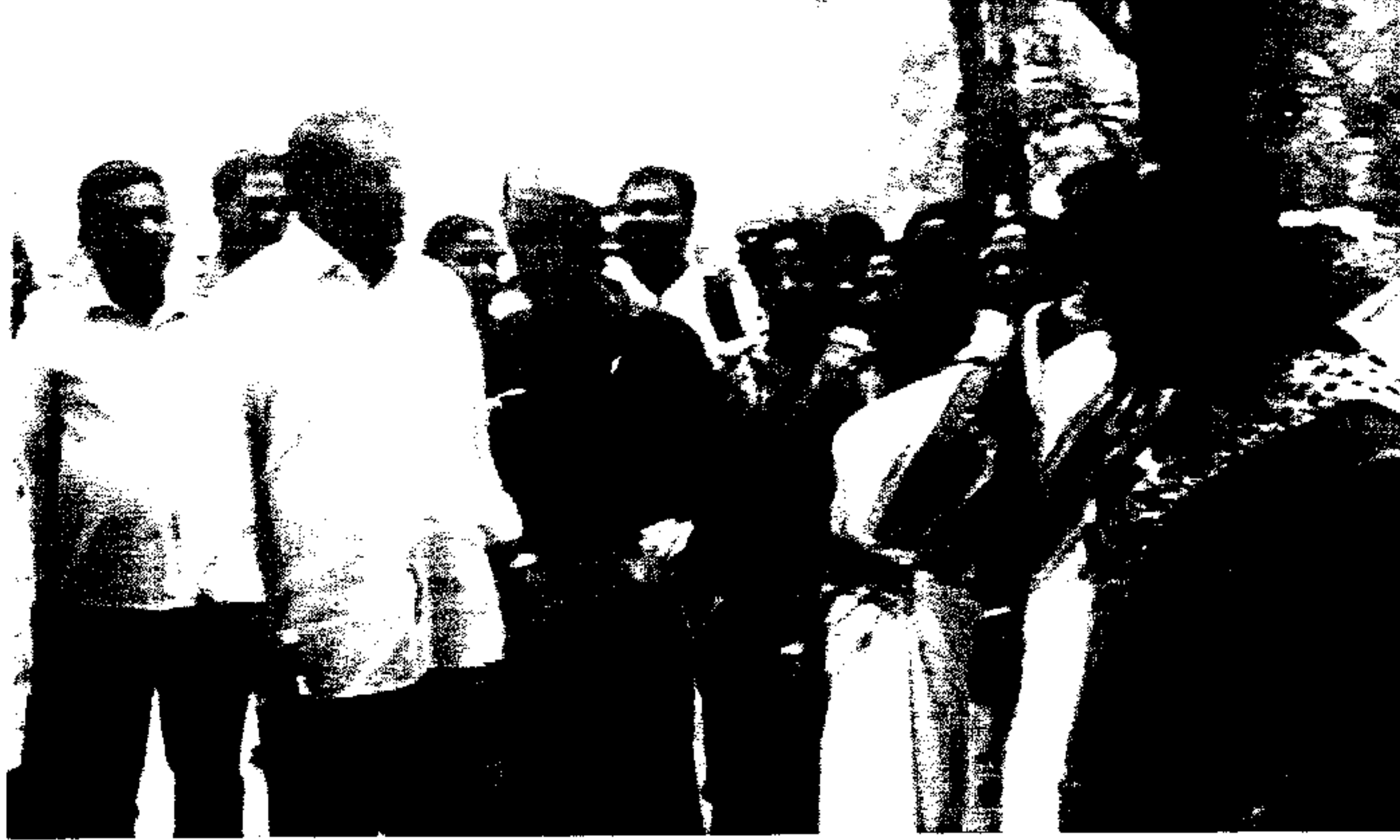
Field visit to the Resettlement Colony